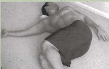
Side lying shoulder/spine stretch