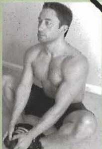
Seated groin stretch