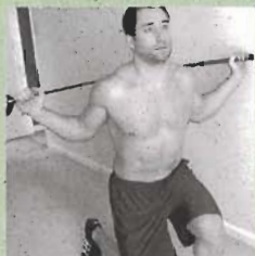
Standing body weight lunge