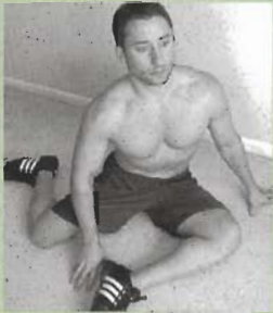
Seated 90/90 hip stretch