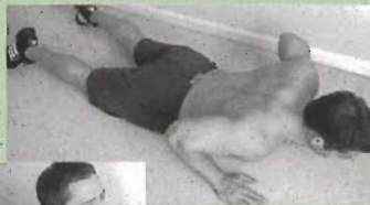
Prone back extension