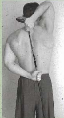
Standing shoulder external rotator stretch