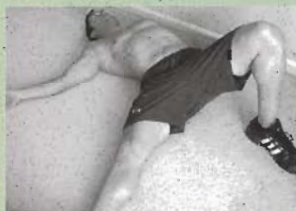
Supine hip opener