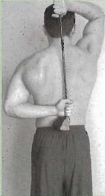
Standing shoulder internal rotator stretch