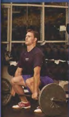
BARBELL CLEAN FROM FLOOR