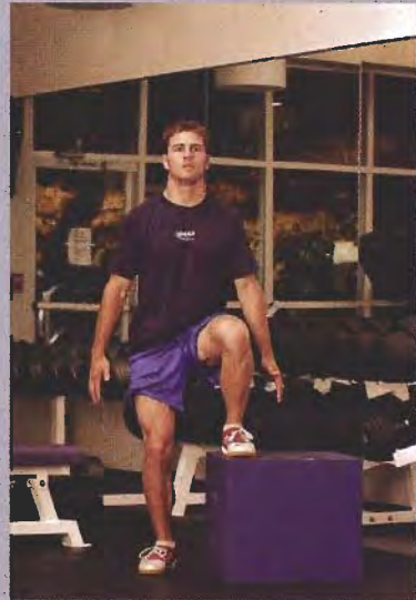
SINGLE-LEG STRIDE JUMP