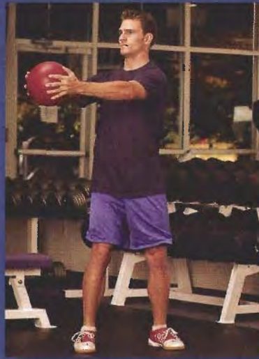
MEDICINE BALL STANDING TRUNK ROTATION