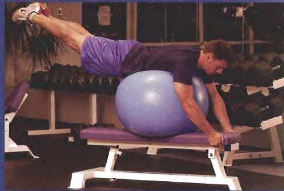
STABILITY BALL PRONE HIP EXTENSION