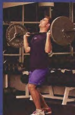
BARBELL STANDING PUSH PRESS